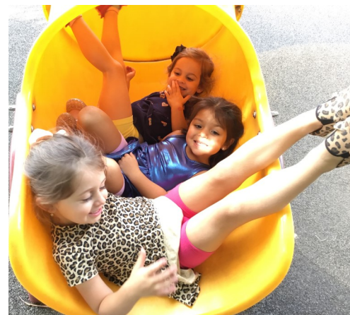
Enjoying outdoor play

We look forward to a wonderful school year full of active learning and fun! L