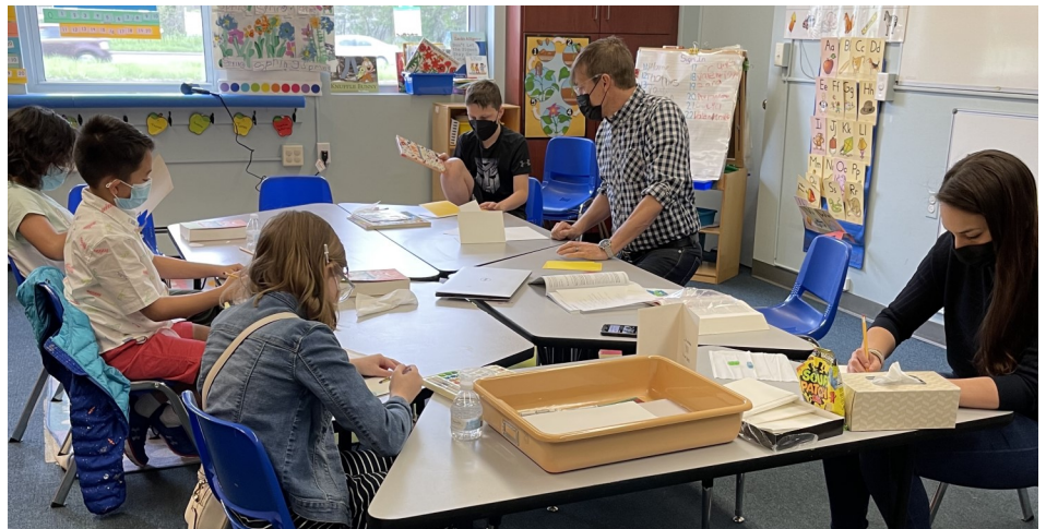
A favorite lesson with the 4th-5th grade class is "God Sightings."

the rind or outer covering. The end product was so cute, and it helped explain the concept of three-in-one to our youngest students.