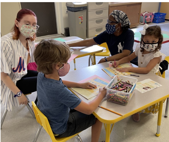
Using the watermelon as an example of three in one, Pre-K students learn about the Father, Son, and Holy Ghost.