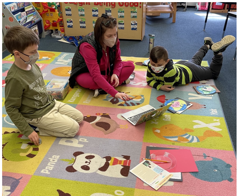
The 2nd-3rd grade class discuss what will go in their prayer jars.

A favorite lesson is on God Sightings (little things we see in the details of life to show that God has created everything). The teachers took their students