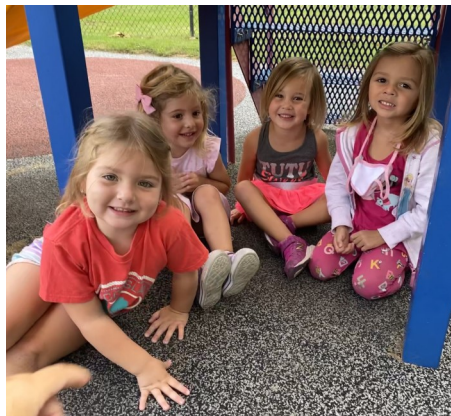
Outdoor exploration and fun

We welcome many new staff members to THE LIFE Day School this year: