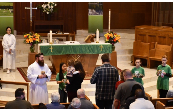
Youth assist with Communion.

It has been amazing to help teach and form these youth in their faith and understanding of the church. The teens are very service-oriented and look for ways to serve God as often as they can. The congregation of THE LIFE has been so welcoming and supportive. It doesn't matter if everything is done perfectly but rather that it is done with a joyful heart. The church is showing the youth and one other that there are opportunities for us all to serve if we step out in faith together.