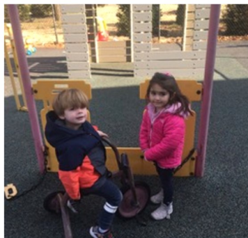
The children at THE LIFE Day School enjoy a beautiful February day.