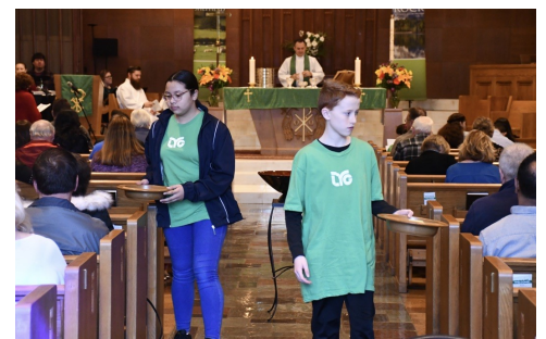
One area of service is collecting the offering.