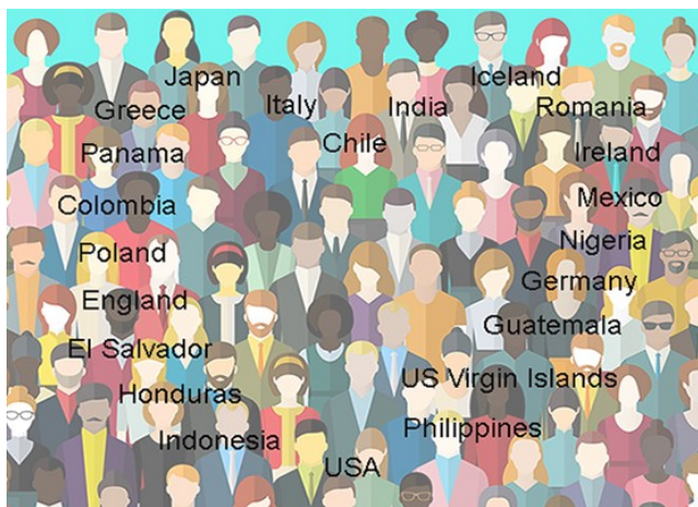
Many countries are represented by those who worship regularly at THE LIFE.

In growing the church and branching off into Sunday morning services, something truly remarkable and inspiring has happened: The prayers and the sermons and the music have continued, but we now see hundreds of people coming for worship. And they continue to come from all over