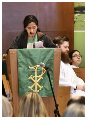
Reading the Bible lesson for the day.

I like contributing to Service Sunday because it teaches me what the church does every Sunday. Being able to help them and be part of the community makes me feel special. I also get to talk to new people and wear a cool shirt! What excites me every week is