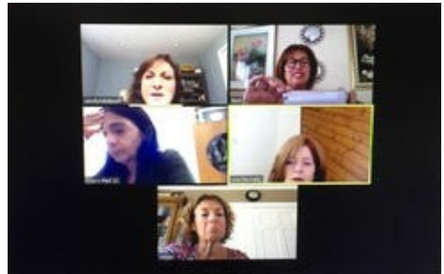
Preschool teachers have fun with a practice run on Zoom.

THE LIFE Lutheran Day School has been working very hard to give the parents and the children some form of nor-